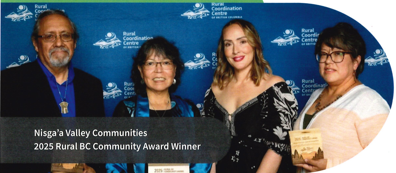
Nisga'a Valley Communities 2025 Rural BC Community Award Winner