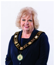
BRENDA LOCKE MAYOR

The Province has already committed $150 million toward support with additional transition costs, but the ongoing gap between the RCMP contract model and a new municipal force is estimated at no less than $462 million over the next 10 years. We are looking at our options to continue to fight this transition, but make no mistake, if the Province has the ability to force this transition ahead with this unprecedented legislation, I will be seeking hundreds of millions more from the Province to protect Surrey taxpayers.