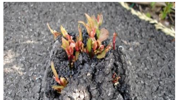
Figure 1. Japanese Knotweed growing through asphalt

There are dozens of other provincially listed noxious weed species that can damage property, reduce land value, and have negative impact of animals that are actively being treated on both public and private land.