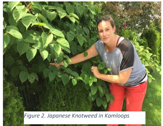
Figure 2. Japanese Knotweed in Kamloops