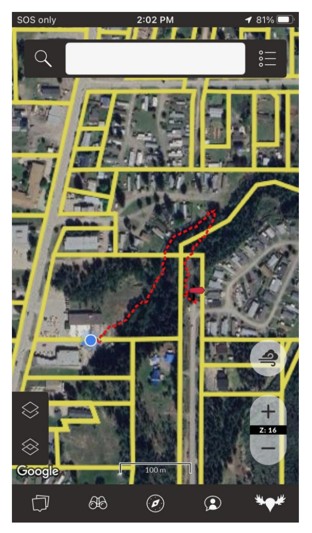
Power Road to AG Foods Trail